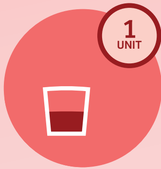
Single small shot of spirits (25ml, ABV 37-40%)