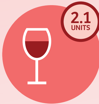
Standard glass of red/white/rosé wine (175ml, ABV 12%)