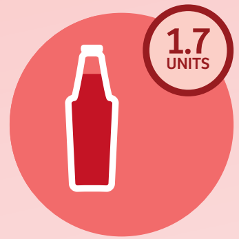
Bottle of lager/ beer/cider (330ml, ABV 5%)