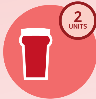
Pint of lower-strength lager/beer/cider (ABV 3.6%)