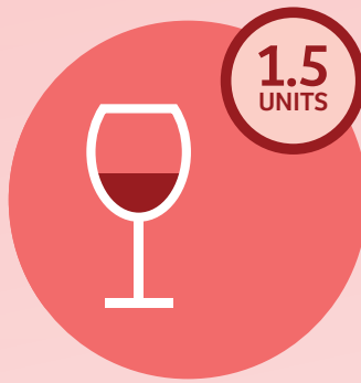
Small glass of red/white/rosé wine (125ml, ABV 12%)