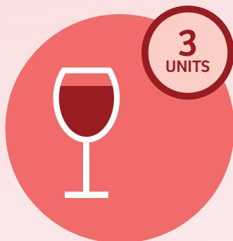
Large glass of red/white/rosé wine (250ml, ABV 12%)