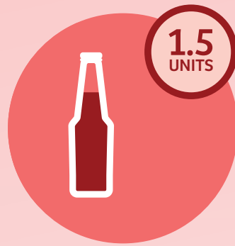
Alcopop (275ml, ABV 5.5%)