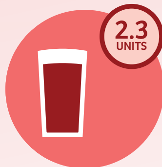
Pint of Guinness Stout (ABV 4.1%)