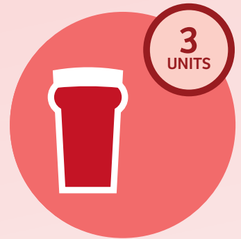
Pint of higher-strength lager/beer/cider (ABV 5.2%)